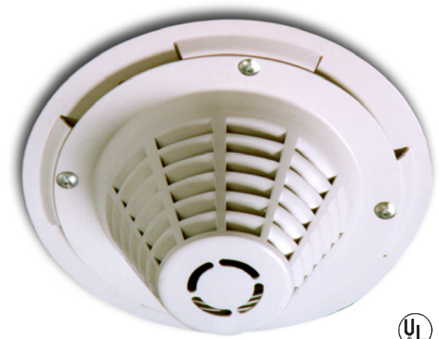
SIGA-DG (Shown with optional mounting flange)